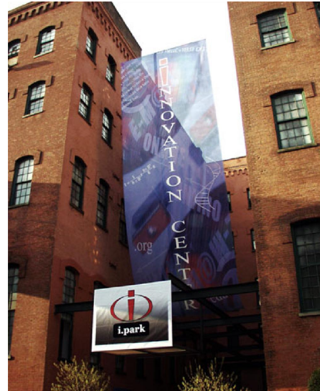
i.park Hudson at 28 Wells Avenue, Yonkers

For more information on ContraFect visit www.contrafect.com .