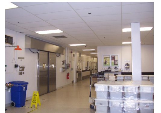
Production Space at 1033 Stonleigh Avenue

The site is being marketed for sale by Cushman & Wakefield / Pyramid Brokerage Company. The asking price is $5,639,370 ($50.60/SF). To view a video clip about the property visit: www.youtube.com/watch?v=4eUL6he9DaU