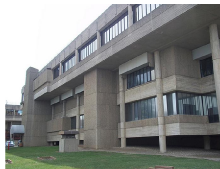
Hudson Valley Research Park, East Fishkill

For more information on Hudson Valley Research Park visit: www.binswanger.com .