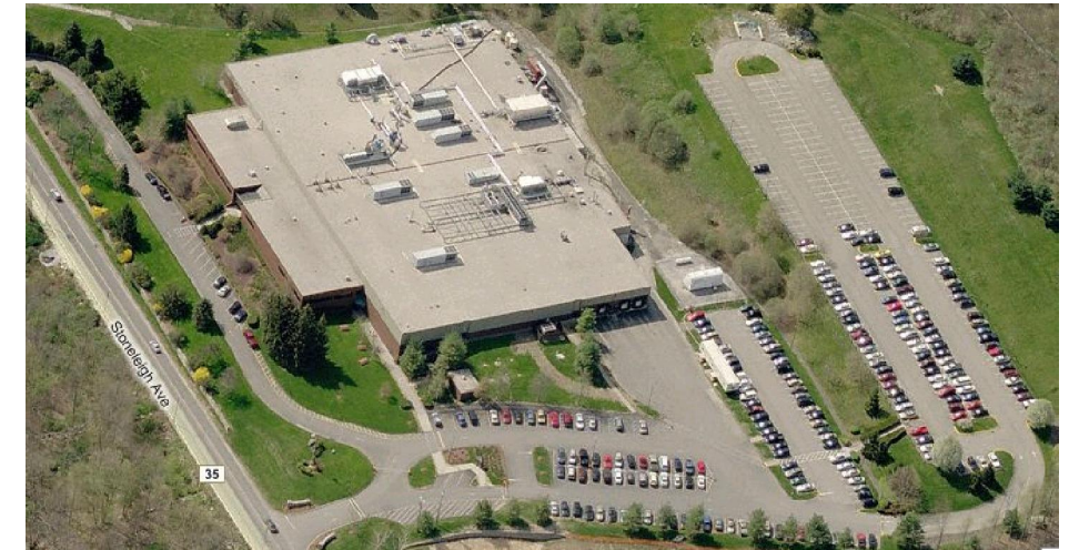
Aerial view of 1033 Stonleigh Avenue

This 111,450 SF former pharmaceutical production facility was constructed in 1986 and sits on 25.75 acres offering open space and a scenic rural setting in Putnam County. The building offers an ideal opportunity for a biotech/pharmaceutical company with a retrofit flexibility for a diverse range of product demand uses.