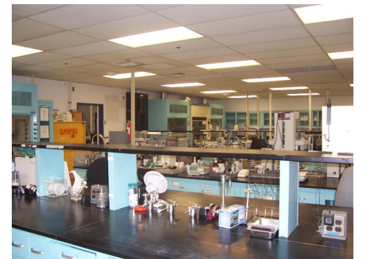
Lab Space at 1033 Stonleigh Avenue